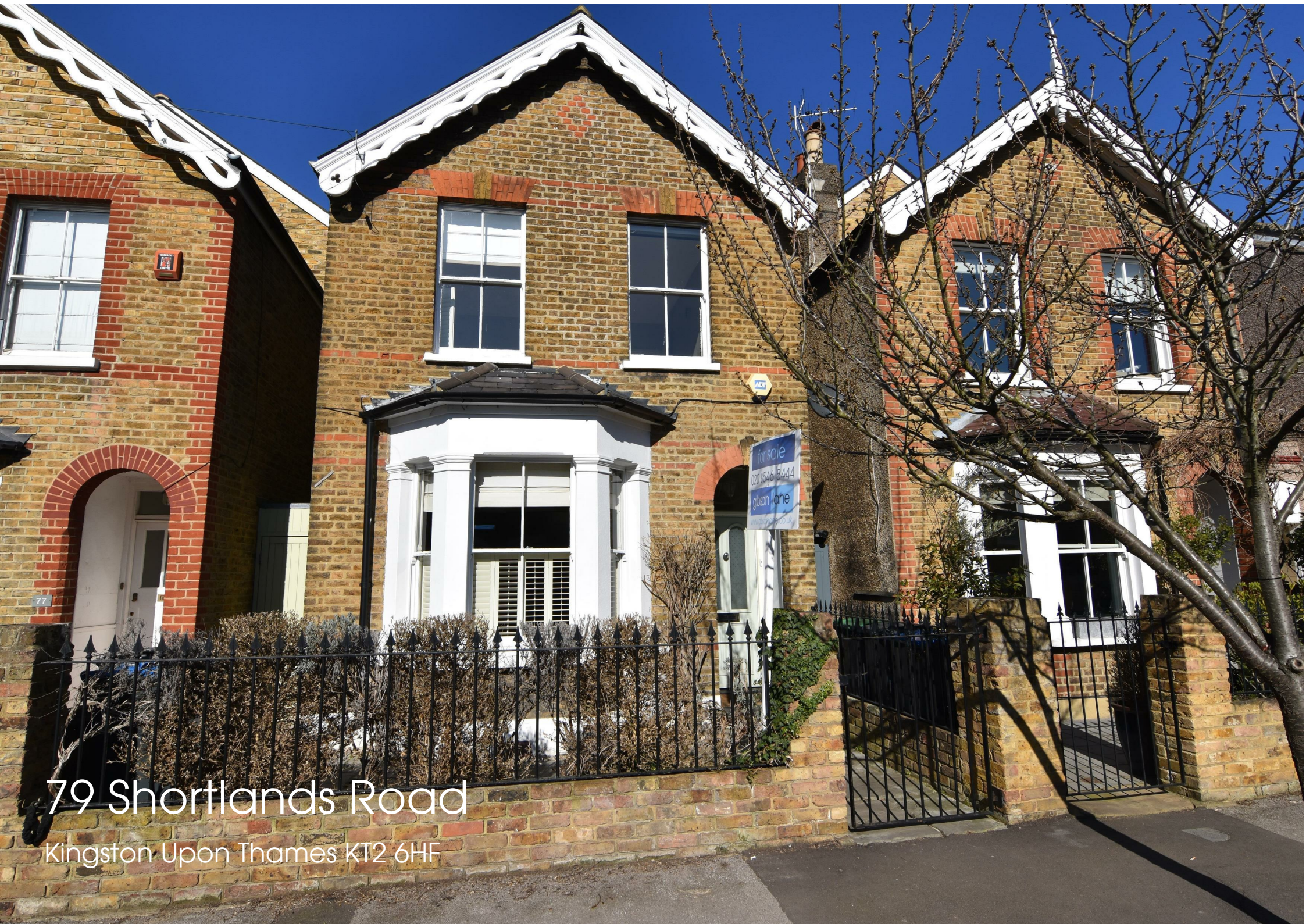
79 Shortlands Road Kingston upon Thames KT2 6HF

34 Richmond Road Kingston upon Thames Surrey KT2 5ED www.gibsonlane.co.uk Tel: 020 8546 5444